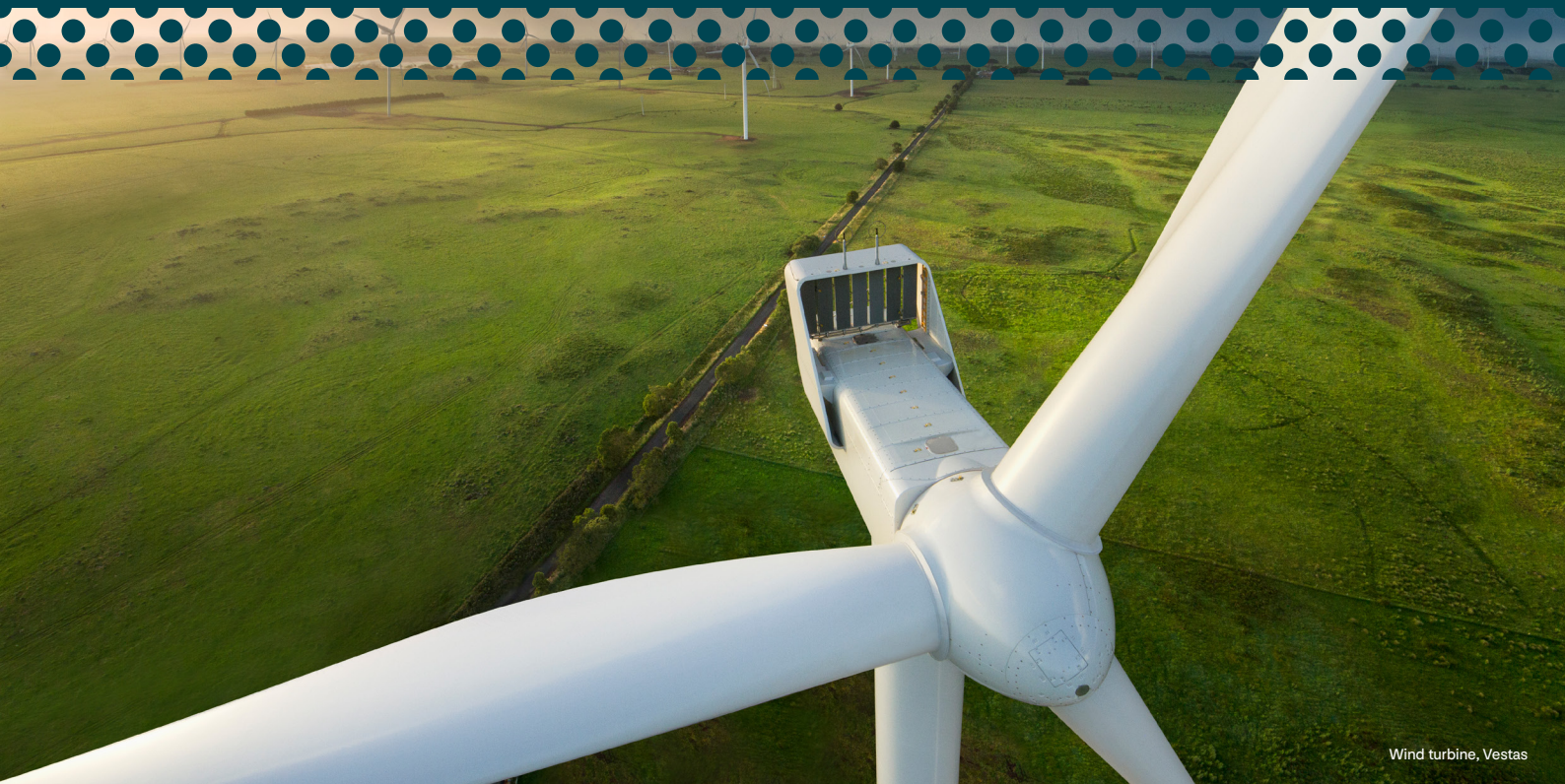
Wind turbine, Vestas