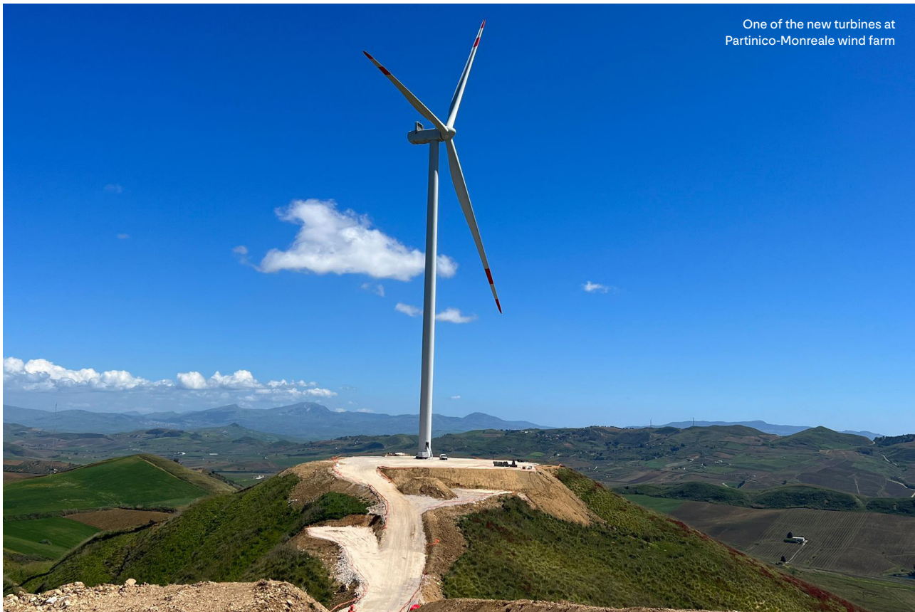
One of the new turbines at Partinico-Monreale wind farm